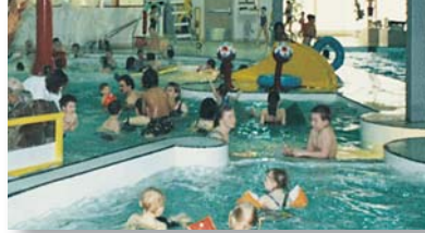
The Aquafun Centre is an aquatic oasis of fun.

The Town of Taber is "A Great Place To Grow" and is located in the Municipal District of Taber, in central southern Alberta. The Town lies within the centre of the rich irrigated, diversified farmland belt, high in heat units and frost free days, with transportation links to major markets. It is served by two (2) primary highways, the crossroads of Crowsnest Hwy. #3 and Hwy. #36 as well as the main Medicine Hat - Lethbridge C.P.R. (Canadian Pacific Railway) line.